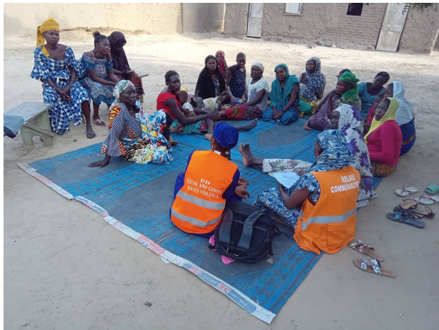
A view of a group sensitization session led by the IP ALVF-EN in Mada, Logone-and-Chari Division