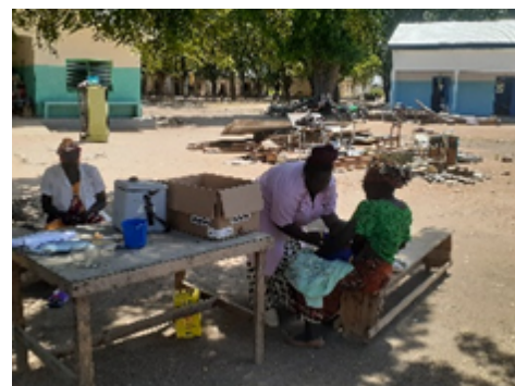
Immunization session performed by BHA-supported midwife, Kolara Integrated Health Centre, Moulvoudaye Health District, Mayo Kani Division