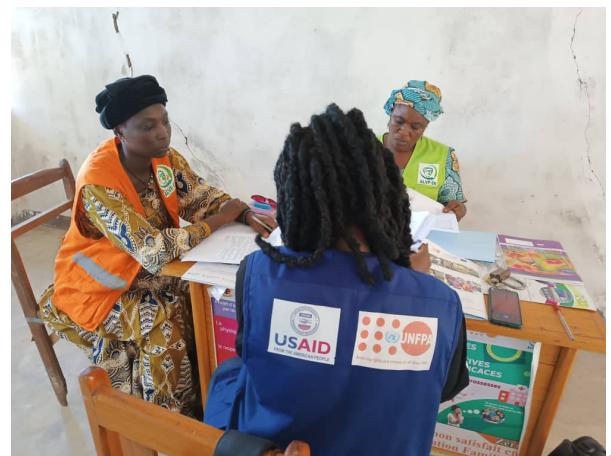
A coaching session of ALVF-EN Social & Community Workers by UNFPA GBV Specialist in Vele, Mayo Danay Division