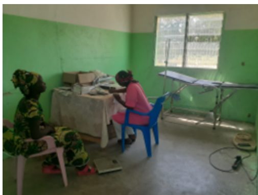
ANC consultation by BHA-supported midwife - Guéréme Integrated Health Centre