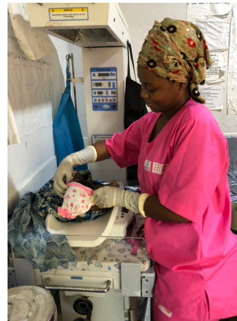
UNFPA-deployed midwife in Mozogo administering first care to a new-born, Mozogo District Hospital, Mayo Tsanaga Division