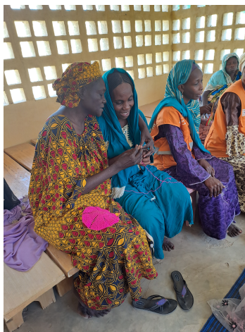
A group of women and girls supported by UNFPA learning weaving and knitting in WGSS in Mada, Makary District Hospital, Logone-and-Chari Division