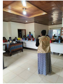
The Bamenda session was an opportunity for UNFPA to strengthen the capacities of IPs. Photo credit: @UNFPACameroon, August 2023