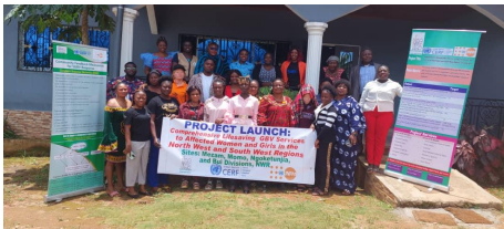
Stakeholders involved in the implementation of the CERF-funded project in the NW/SW regions gathered in Bamenda to foster their understanding, and map out strategies for a smooth running of activities. August 2023