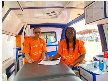
A view of the mobile clinic during the holiday sporting activities. Photo credit: @UNFPACameroon, August 2023