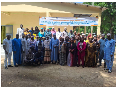
Participants at the training workshop of surveyors on the use of GBV data collection tools in Maroua. Photo credit: @UNFPACmr, Aug. 2023