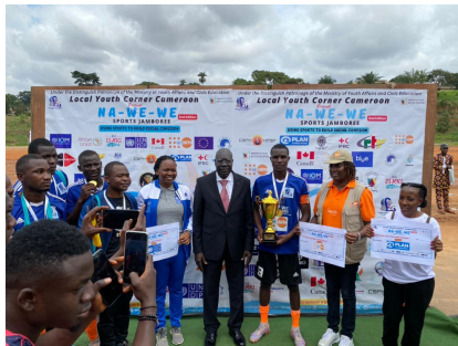
UNFPA supported the 2-month-long holiday sporting activities organized by youth-led organizations and the Ministry of Youth Affairs in Yaounde with mobile clinics that allowed for the provision of SRH services. Here, the Minister, flanked by UNFPA staff, poses with winners of various competitions. Photo credit: @UNFPACameroon, August 2023